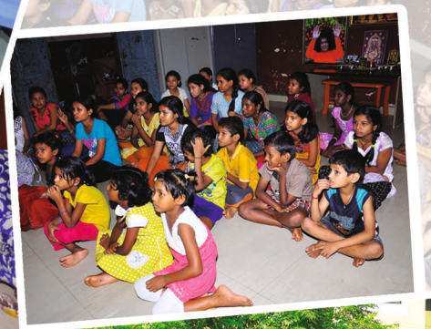
6 Orphan Home visit