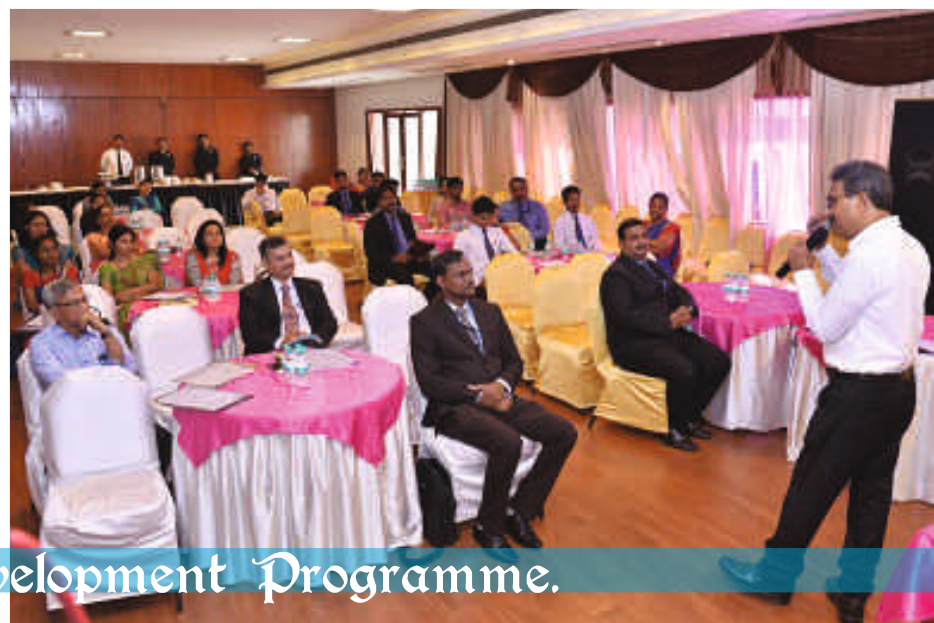
Faculty Development Programme.