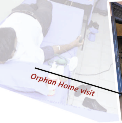
Orphan Home visit