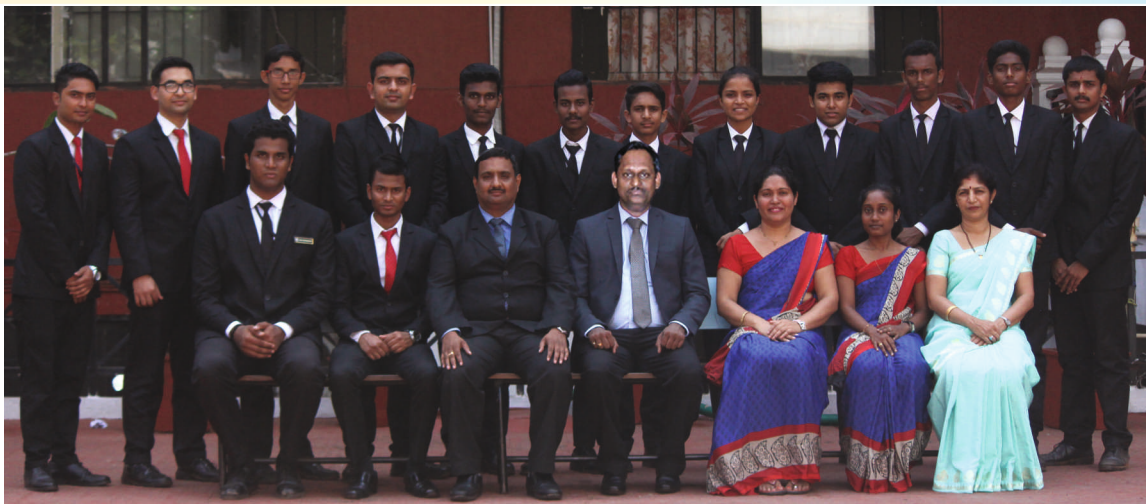
Le Club Benvento