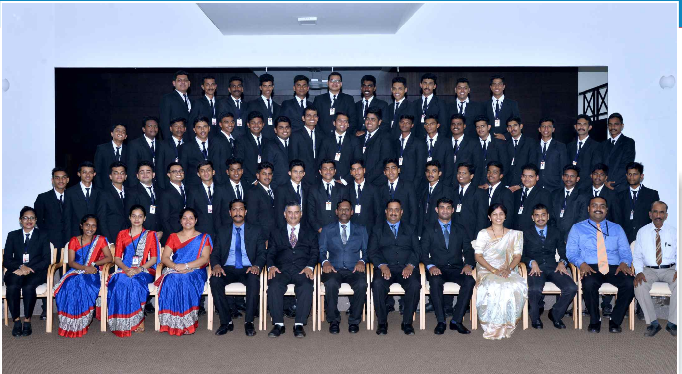
III Yr. BHM