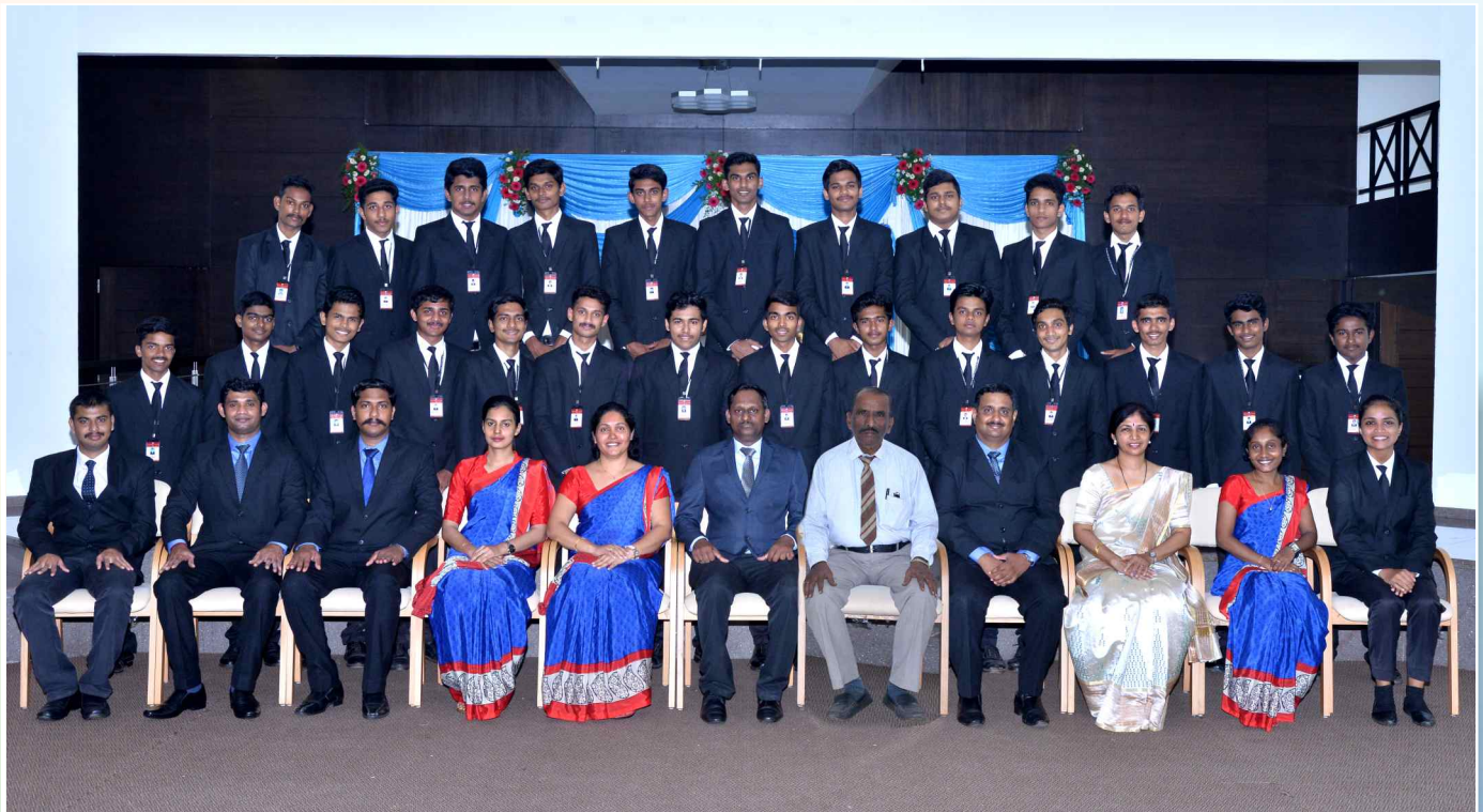
II Yr. BHM