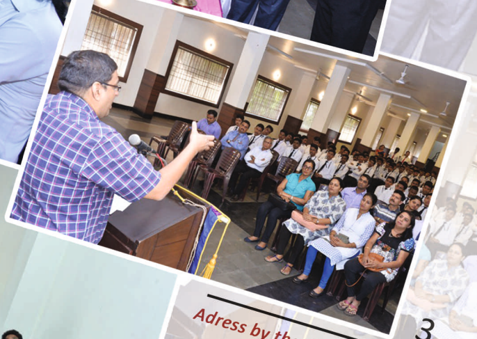
3 Adress by the Chief Guest