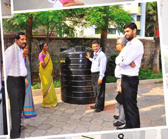
8 Orphan Home Visit