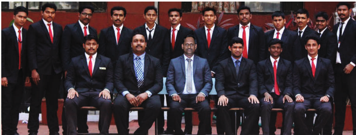
Le Club Aromatum