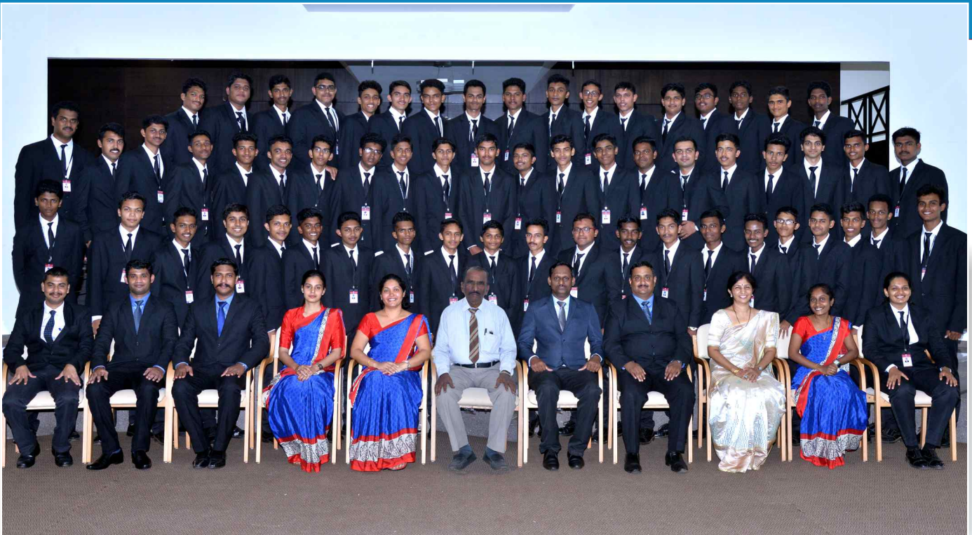
I Yr. BHM