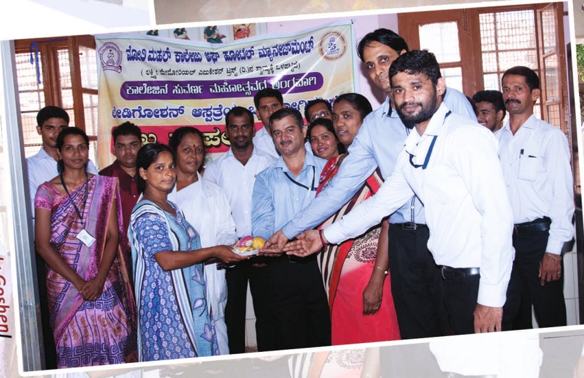
Fruit Distribution at Lady Goshen