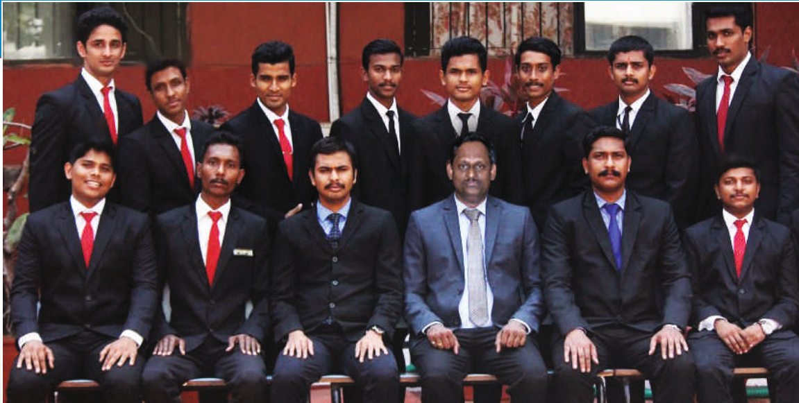
Le Club Ambrosia