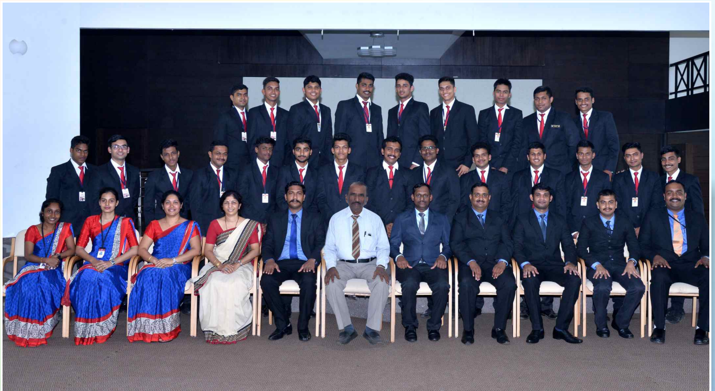
IV Yr. BHM