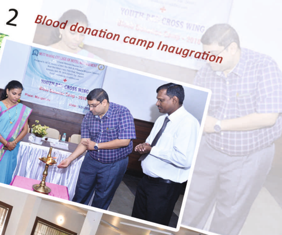
2 Blood donation camp Inauguration