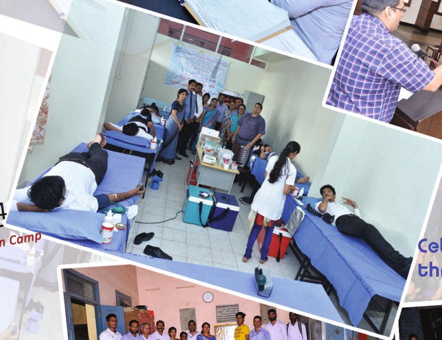
4 Blood Donation Camp