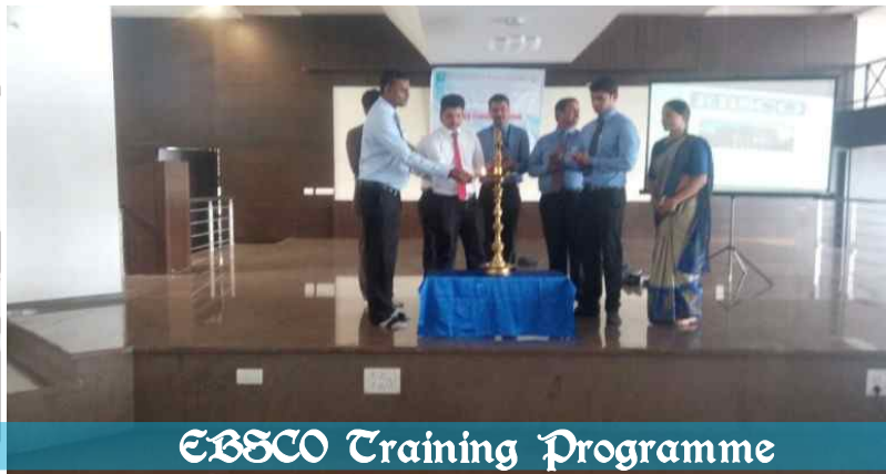
EBSCO Training Programme