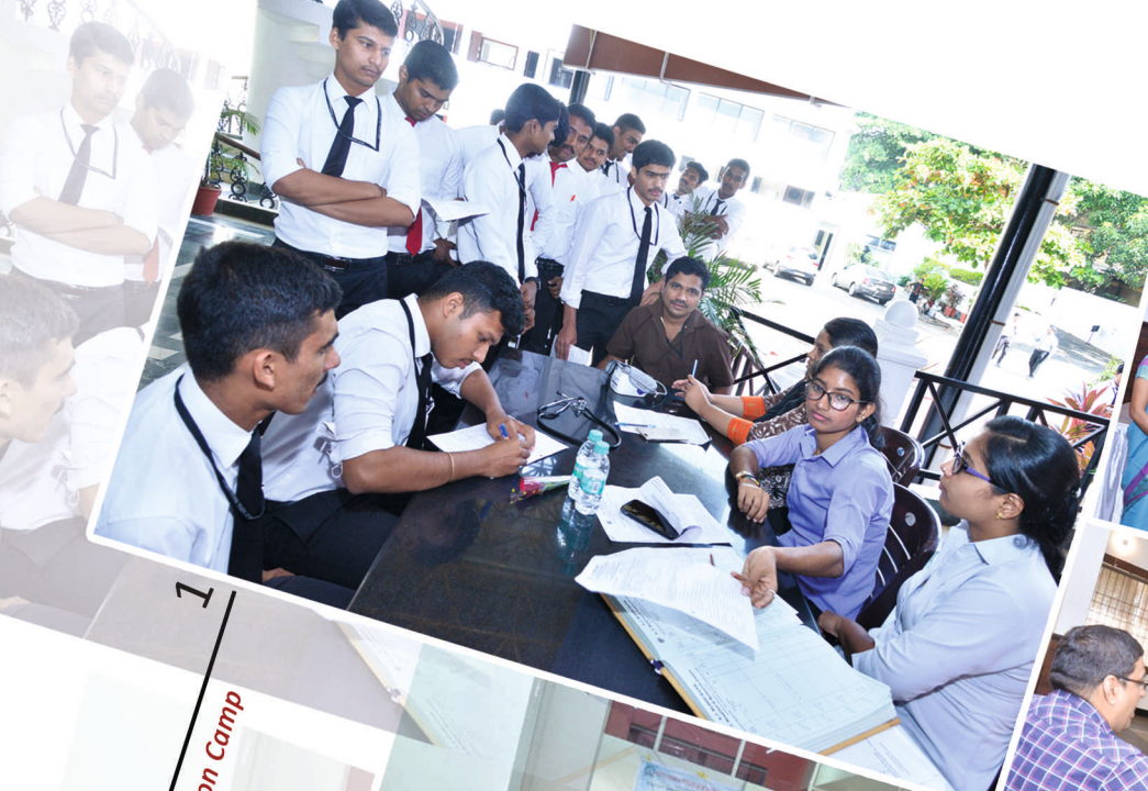
1 Blood Donation Camp